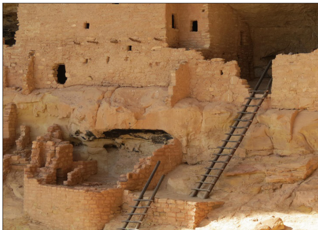
Ancestral Puebloan Dwelling Long House (Mesa Verde National Park)