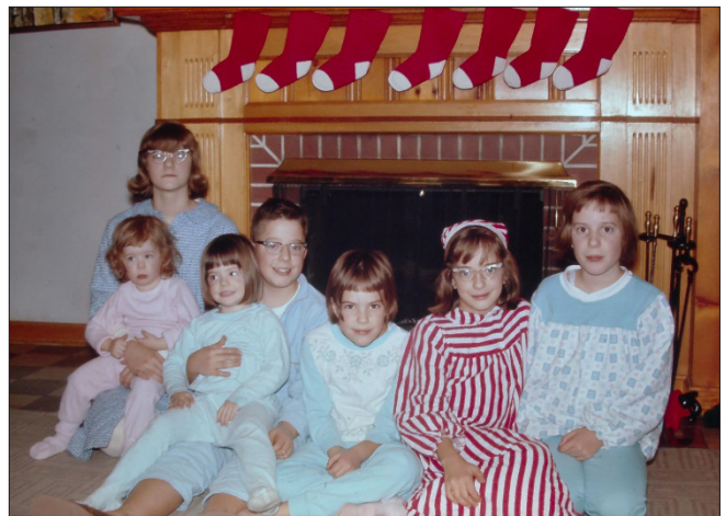
Remembering Christmas past – 1965