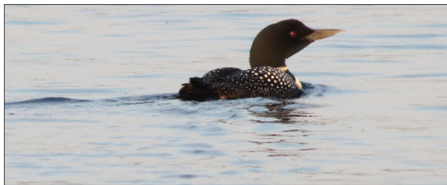
Loon at Green Lake

A string of 90-degree sweltering days and then a cold snap and our summer is drawing to a close here in Maine. The end of summer seems to come all at once and we look at each other with dismay and say, “where are the warm days and cool nights that we love so much?” It happens every year. You’d think we would be used to it by now, and we are, but still, couldn’t we have just a few more days of August sun and warmth before we turn toward Autumn?