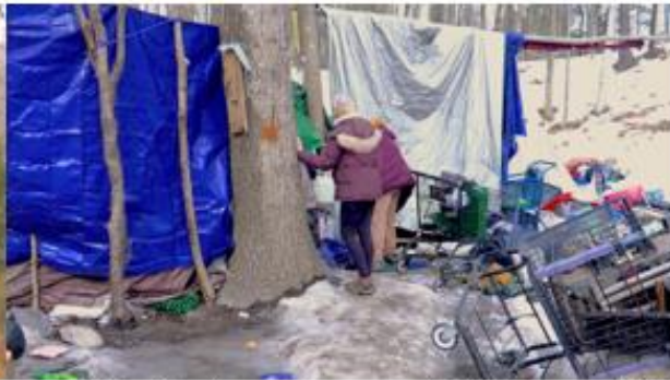
Valley Ave. Bangor Encampment w/ Kathleen and Kelly distributing hot drinks and food to the unhoused