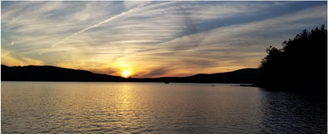
The sun setting one last time in July, 2022. Green Lake, Maine