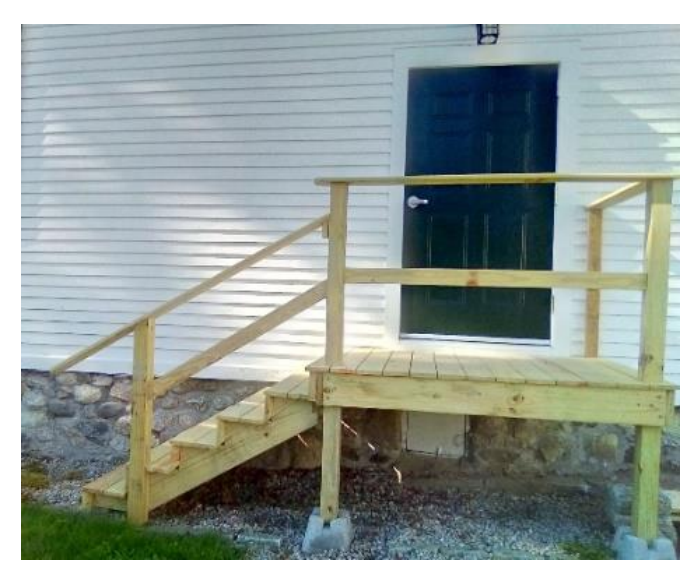
Newly rebuilt emergency exit landing and stairs.