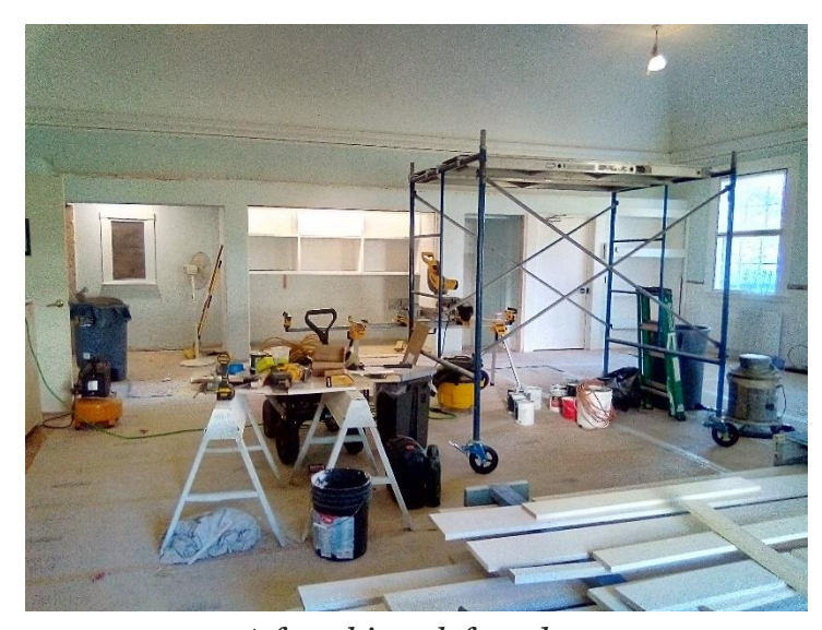
A few things left to do.

You are welcome to contact me if you have questions, concerns, and ideas.