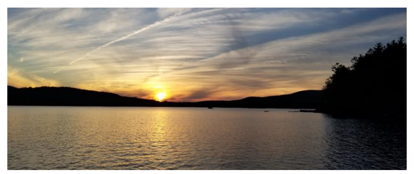
The sun setting one last time in July, 2022. Green Lake, Maine